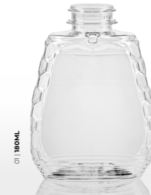
01 | 180ML