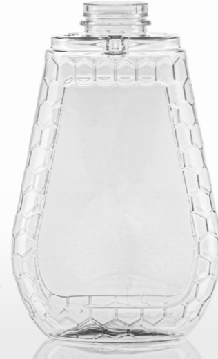
03 | 265ML