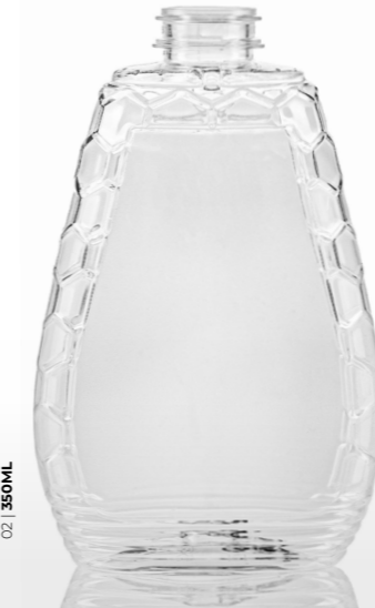
02 | 350ML